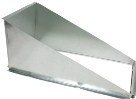
14" x 36" Part Number: VA-1436