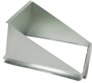
14" x 18" Part Number: VA-1418