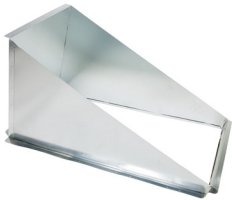
14" x 30" Part Number: VA-1430